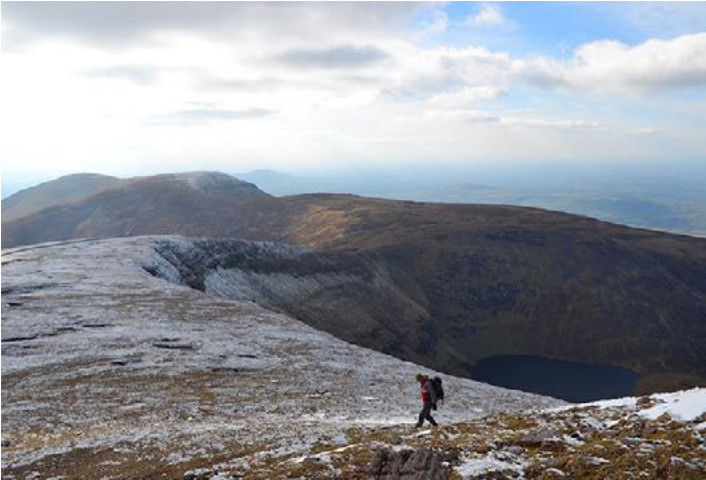
The Galtees Mountain Range/ Declan Cunningham