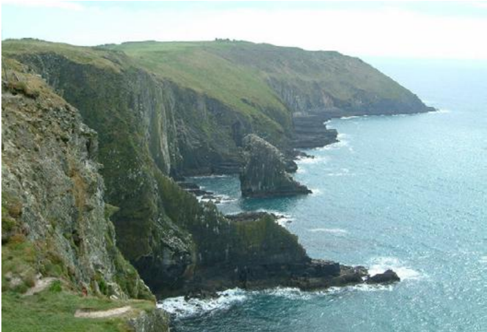
Old Head of Kinsale Loop