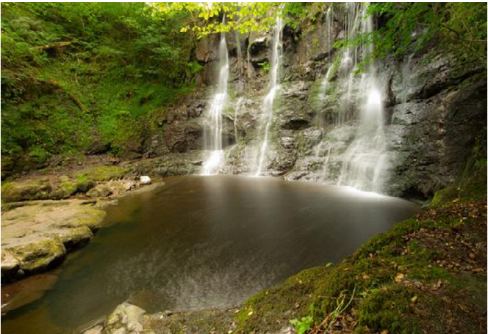
Umberto Nicoletti/ Flickr