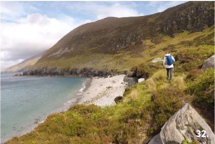
Annagh Bay/ Heather Snelgar