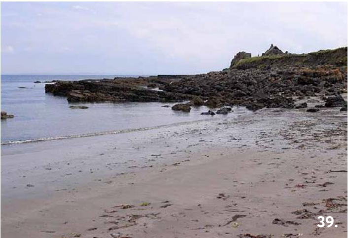
Dunmoran Coastal Walk.jpg

Check out our full review of the Dunmoran/Aughris coastal walk .