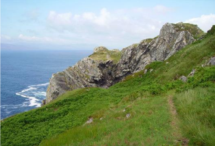
The Sheep’s Head Way