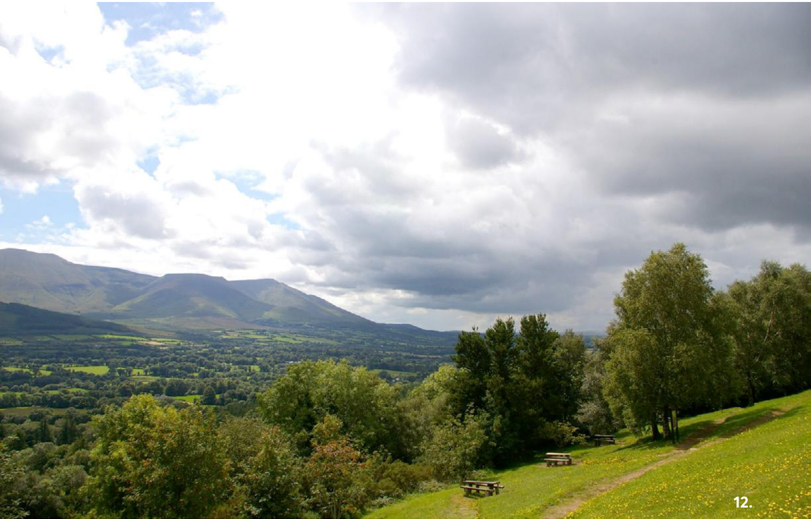
Glen of Aherlow