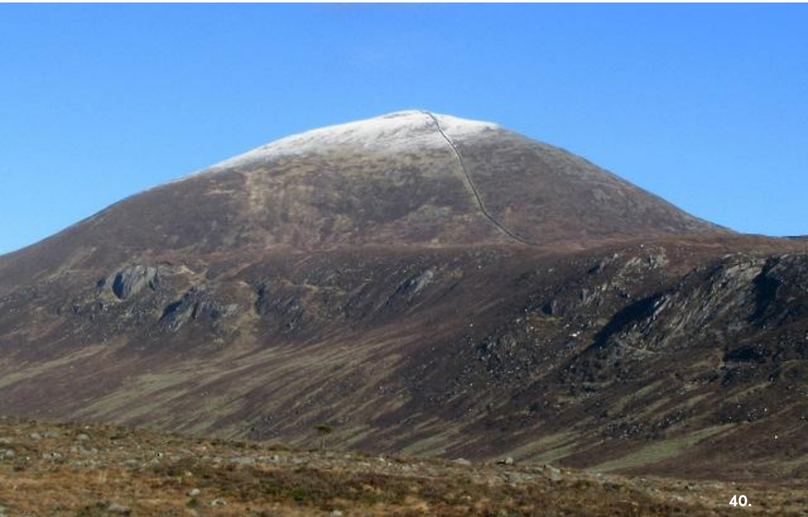
Slieve Donard