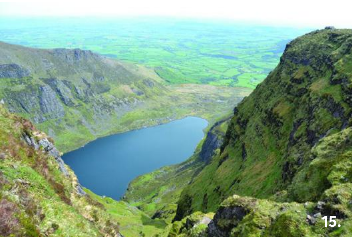
Coumshingaun corrie lake

This loop around the beautiful Coumshingaun corrie lake and the surrounding mountains will make your jaw drop. It'll take you about four hours. Park up at Kilclooney bridge and begin the gentle ascent up the mountain. Take in the steely blue of the lake and the beauty of the surrounding area. There is also some great rock climbing and ice climbing spots in the area.