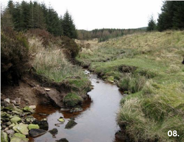
Young River Barrow

This four-day walk along the River Barrow is still somewhat of a hidden gem for anyone but the locals. The Barrow Way follows surviving towpaths and riverside roads, from Lowtown in Co Kildare to the idyllic little village of St Mullins in Co Carlow. The peaceful route winds its way through the sylvan landscape following the river. You'll find accommodation in one of the many quaint villages dotted along the grassy tracks of the Barrow Way.