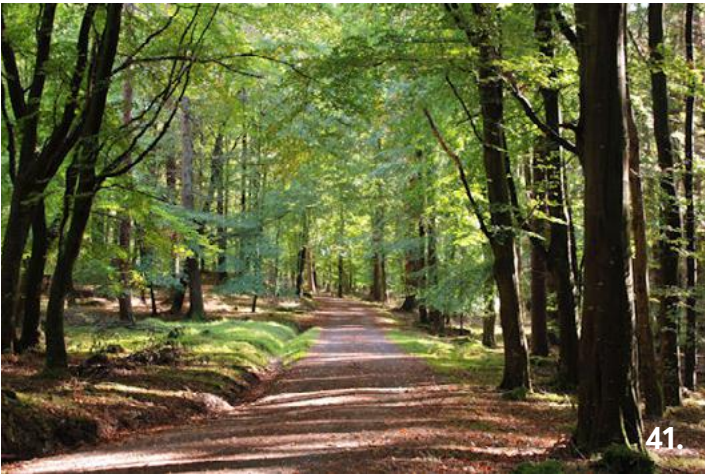
Tollymore Forest Park

For more information on Irish walks, check out The Ireland Walking Guide .