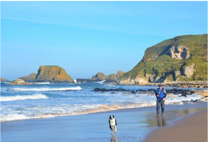
The Causeway Coastal Route: Ballintoy – Portbalintrae