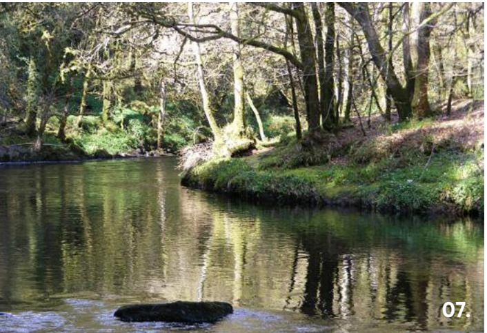
Avonmore River

The Avonmore Way is a relatively new trail along the beautiful Avonmore river in Co. Wicklow. Take a stroll through the wooded valley, starting at Trooperstown Forest. Follow the waymarked trail through the forest under the cover of spruces and emerge out at the hamlet of Clara Vale. This 12km route will take you three to four hours to complete.