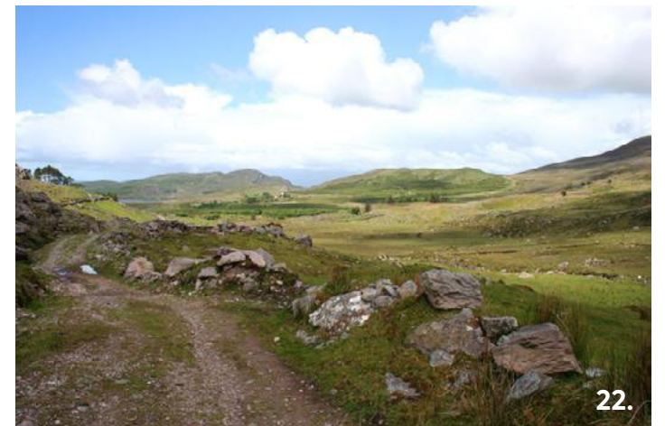
Kerry Way

Kerry is already well known on the international stage for its rural beauty. And the Kerry Way is no exception; it is stunning. Boasting views across emerald green fields and out on to the crashing Atlantic ocean. There are few better places in the world. The 215 km route starts and finishes in the vibrant town of Killarney. The trek through the Iveragh Peninsula can take roughly 7-10 days to complete. Camp or stay in one of the many fine establishments dotted along its entirety.