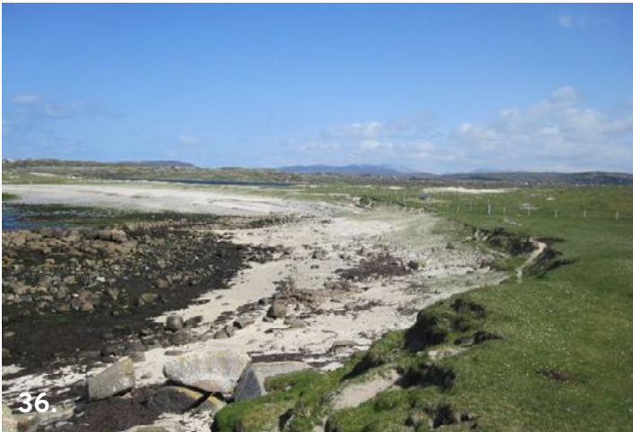
Fahy Lough beyond the Dunes

Portumna Forest Park covers almost 450 hectares of which the majority is dominated by coniferous woodland. It is a nature nerds paradise with ash, beech and silver birch dotted along the lakeside. Yew and juniper also appear. Animal species in the area include red squirrel, fallow deer, foxes, badgers and a white tailed sea eagle who nests there. There are four walking trails of varying distances in Portumna Forest Park. One is the Rinmaher Walking Trail, a long singletrack loop with great views along the lakeshore.