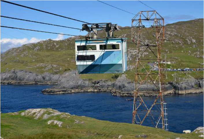
Dursey Island Cable Car