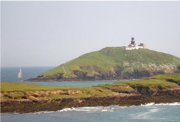
Ballycotton Cliff Walk