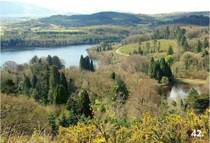
Castlewellsan Forest Park

This forest walk has a bit of a steep climb to it, but this means you can peak between the trees for some superb panoramic views of the Mourne Mountains and surrounding drumlin landscape. Just follow the yellow waymarkers. This is one of the more difficult trails as it is rocky in places and has some tricky steps up to the summit, which stands at 272 metres. There is also three waterfalls to be spotted in the park and a visitor centre, shop and restaurant.