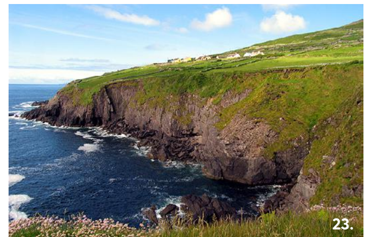
Cliffs along the Dingle Way towards Slea Head

Check out our full list of walks in Co Kerry .