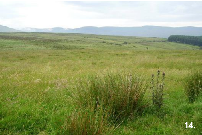
Rough grazing in the Comeraghs

Check out our full review of the Comeragh Mountains for more information.