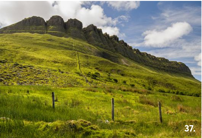
Under bare Ben Bulben

This loop will take you three to four hours. Climb to the plateau of Kings Mountain which is steeped in Irish mythology and thought to be Fionn mac Cumhaill's table. Then on to the cliffs at Benbulbin Head (526m). Experience the home of Yeats in all its glory. No wonder he was inspired to write such brilliant prose, with views like this on his doorstep.