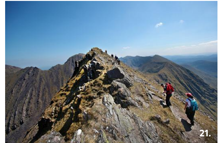
Caher Ridge MacGillycuddy's Reeks, facing east.

The Cronin's Yard Loop will take you across sandy paths and up through mountain tracks. Starting from the trailhead at the exit from Cronin's Yard, just follow the purple arrow. You'll walk along the Caol River, the Gaddach River and Lough Callee. Cronin's Yard is the gateway to the MacGillycuddy's Reeks and an ideal base from which to explore the surrounding countryside. Plus, you can get your packed lunch before you head off and a hot shower afterwards.