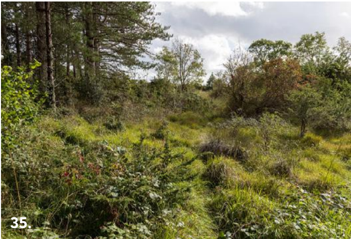
Portumna Forest Park

This scenic looped walk is in Tuam, Co Galway. At just 4km long, it is a short spin but steep in parts. The view at the top of the climb is something special to behold. The walk takes place on a rough path through the wooded area, which is made up of oak, ash, hazel and other broadleaf trees. It is a part of the country that is very much connected with our history, with some stunning neolithic cairns on top. Two of which are rumoured to be the burial places of Queen Maebh of Connacht and of Finnbhearra, King of the Connacht fairies.