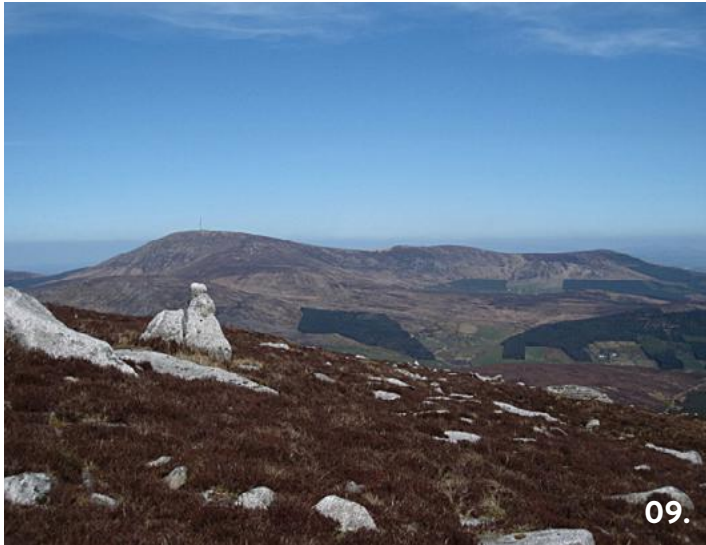
Mt Leinster

This four-day walk along the River Barrow is still somewhat of a hidden gem for anyone but the locals. The Barrow Way follows surviving towpaths and riverside roads, from Lowtown in Co Kildare to the idyllic little village of St Mullins in Co Carlow. The peaceful route winds its way through the sylvan landscape following the river. You'll find accommodation in one of the many quaint villages dotted along the grassy tracks of the Barrow Way.