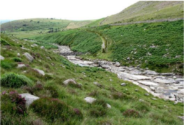
The Ulster Way