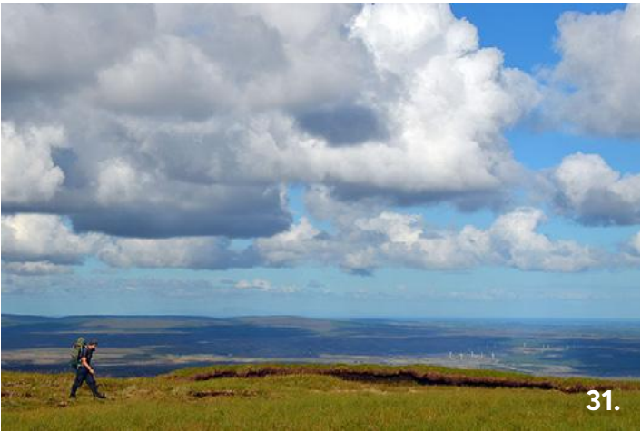
The Nephin Bogs/ Declan Cunningham