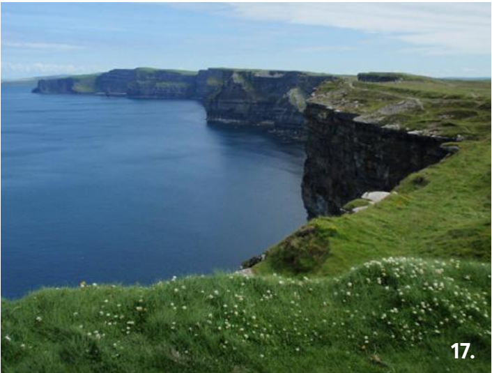
Cliffs of Moher

The Burren is well known for its unusual landscape and what better way to experience the limestone pavements than on foot. Winding its way from Lahinch to Corrofin, the karst landscape of bedrock makes for a piercing contrast to the deep emerald green of the Atlantic swell below. It will take around five days to make your way around the quiet tarmac roads, forest paths, tracks and up a few of the sweat-inducing climbs.