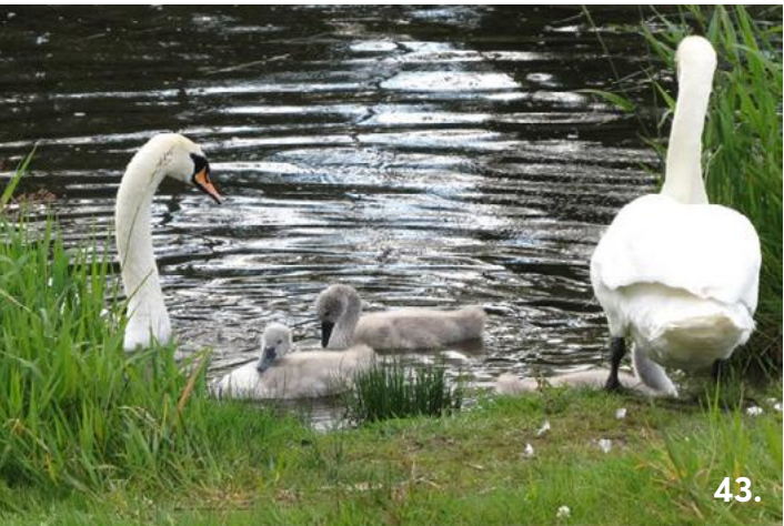
Swans at Lough Ramor

The Virginia Slí na Sláinte is a 5.5km circular route. Located at Deerpark Forest, just outside Virginia, Co Cavan, the route follows beautiful tree-lined paths through the forest and passed Virginia Golf Club, taking in the banks of Lough Ramor. The full route will take about an hour and a half to walk and can be walked in both directions.