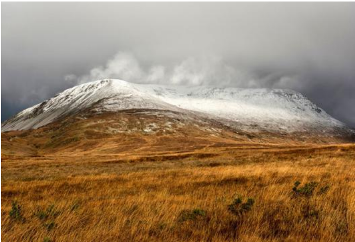
Muckish Mountain